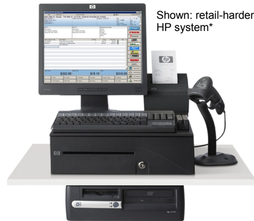
Shown: retail-hardened HP system*